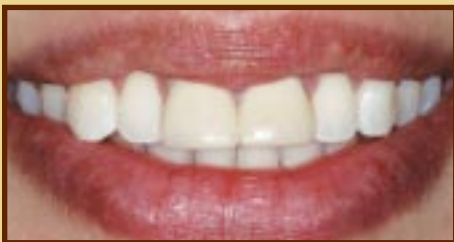
crowns & veneers

● Create a more balanced and symmetrical gumline with veneers or gum sculpting. Whether your gums have begun to recede or you have been longing to reveal the beautiful enamel under too much gum, we have a technique that will work for you.