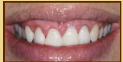
gum sculpting & veneers